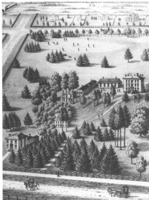
Hope Campus, c. 1890

Here are some excerpts from the new booklet Campus Alive: A Walking Tour of Hope College . Beginning October 1, it will be available at the Joint Archives, the Hope-Geneva Bookstore, and at select booksellers in the Holland area.