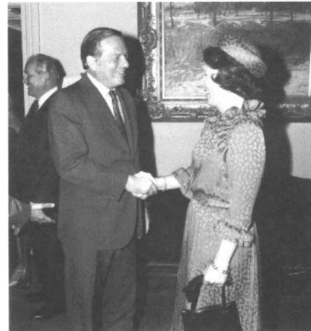
Guy Vander Jagt and Queen Beatrix of the Netherlands, 1982

The collection also contains a wealth of material on issues relating to the Great Lakes, from shoreline erosion and other problems created by the high water levels of the 1970s and 1980s, to fishing and water quality improvement.