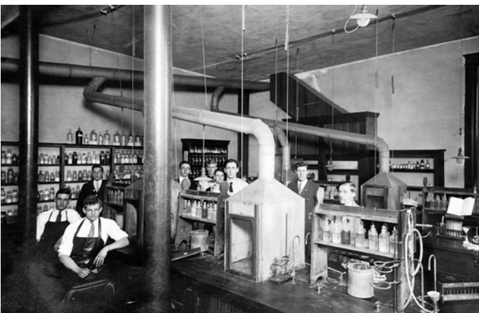
Chemistry students at work in a new state-of-the-art science lab in Van Raalte Hall, 1904

The vision and leadership of the 1900s formed a pivotal foundation for the emerging science education, and this foundation has held the strength for the future continuing pursuit of excellence in science education at Hope College. Despite the tough economic times of the late Depression era, fundraising began for a new building to house the science