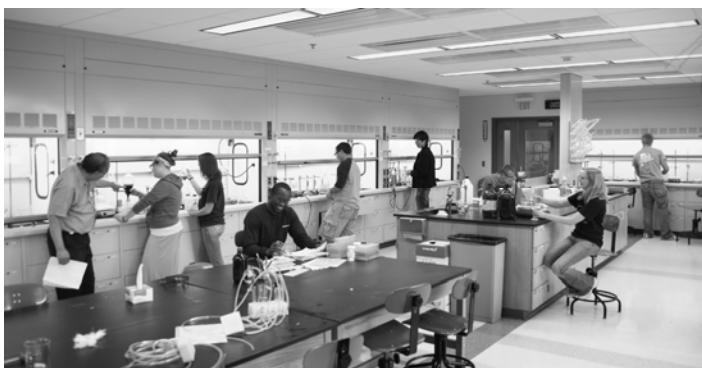
Modern lab in the A. Paul Schaap Science Center

Hope College embraces an institutional core liberal arts curriculum emphasizing interdisciplinary learning and educating the entire person: mind, body, and spirit. The chemistry, nursing, and engineering programs are respectively accredited by the American Chemical Society, the Commission on Collegiate Nursing Education, and the Engineering Commission of the Accreditation Board for Engineering and Technology. Furthermore, Hope continues the tradition of research as a central and foundational component of the teaching philosophy. Students are given the opportunity to participate in meaningful research projects with faculty mentors. These programs are funded by numerous sources: National Science Foundation, National Institutes of Health, Homeland Security, Research Corporation, Petroleum Research Fund, Whitaker Foundation, Pew Foundation, National Aeronautics and Space Administration and the Michigan Space Grant Consortium, Howard Hughes Medical Institute, and others. In 2008, the science division received more than $3 million in external grants and awards. Students are often co-authors of publications in scientific journals and present their discoveries at regional and national professional meetings. In 2008, the faculty produced close to twice the national average number of scientific publications among